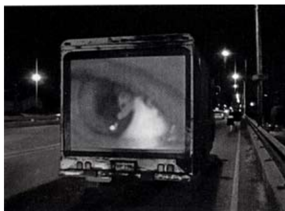
William Pope.L, Blink , 2011, mixed media, Installation view, New Orleans.